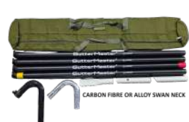
SUPREME CARBON FIBER CLEAN FROM THE GROUND KIT