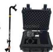
CLEAN FROM THE ROOF TOOL KIT