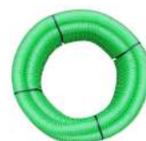
ADDITIONAL 10M OF CLEAR 2.5" LIGHTWEIGHT VACUUM HOSE