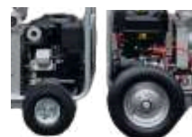
400MM WHEEL UPGRADE