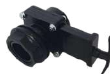
SLIDE GATE LIQUID VALVE FOR WASTE DRUM