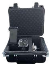
WIRELESS CAMERA KIT