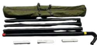
SUPREME CARBON FIBER CLEAN FROM THE GROUND KIT