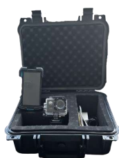
Wireless Camera Kit