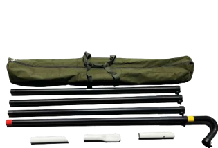
Supreme 50mm OD Carbon Fiber Clean From The Ground Kit