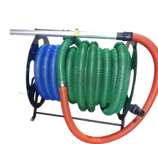
Whip End Flex Hose