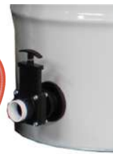
Liquid Drain Valve

Applied Cleansing Solutions Pty Ltd | F2/10-14 Tower Court Noble Park VIC 3174