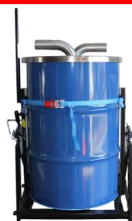
Additional 205L Drum Tipper