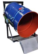
Drum Waste Discharge Chute (Trailer & Utes)