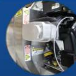
NO MAINTENANCE FAN