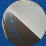
STAINLESS STEEL CONSTRUCTION