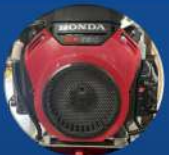
HONDA GX630 V TWIN ENGINE

As a rapid recovery machine it is perfect for fast and profitable ceiling insulation removal with the benefit of having a significantly longer working lifespan with minimal ongoing maintenance costs. Insulation Master® comes complete including 30 metres of anti-static polyurethane vacuum duct hose. Available as either a skid mount or integrated into a custom road registrable trailer.