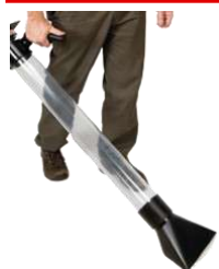
Insulation removal tool