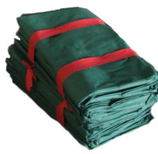
Additional 400 litre bio degradable bags