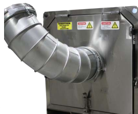
90-degree inlet elbow for boom