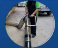
30MTS VACUUM HOSE