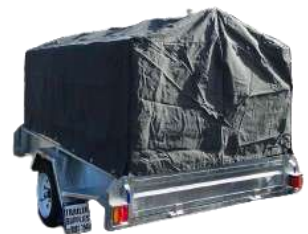
Cage 600/900mm With or without canvas cover