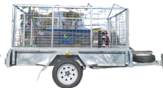
8 x 5 Galvanised dual axle / single axle trailer